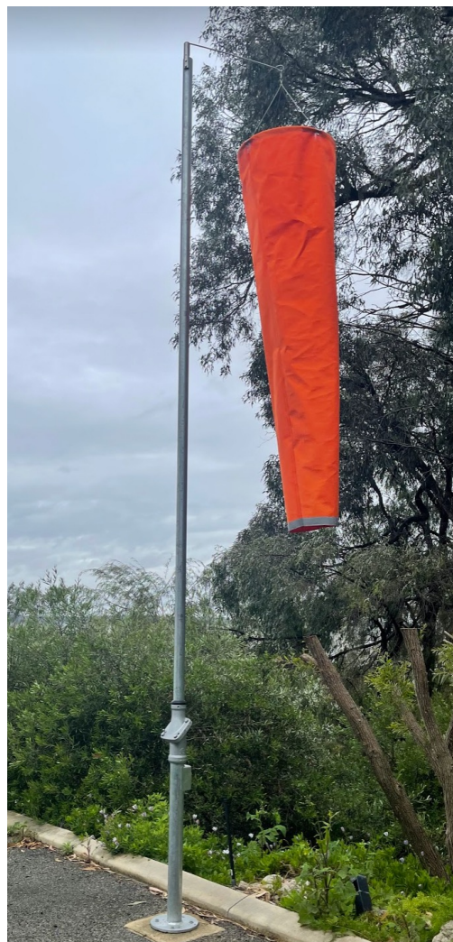
Overall concept - 3m - 6m Swivelpole base mounted. Can accommodate Windsocks up to 2400mm in length (Helicopter HLS specification)