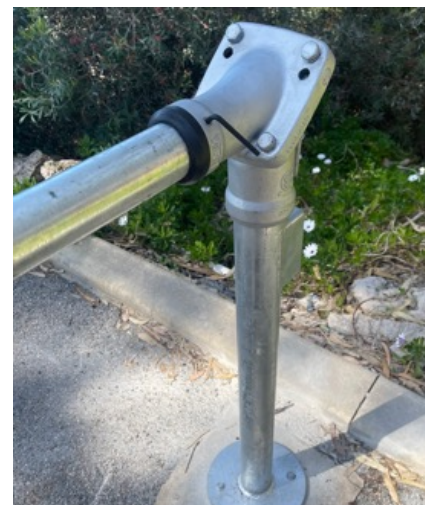
The design of the hinging base eliminates the need for an elevated work platform, with all work able to be carried out at ground level