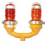
SafeSite® L-810 Red LED Side Light

Dialight also offers these LED obstruction lights for use in Hazardous Locations (Class I, Div. 2)